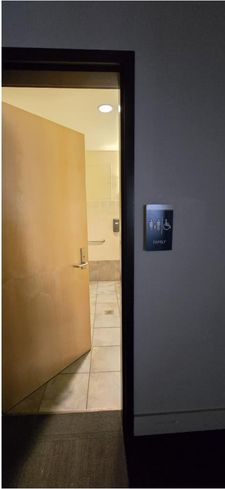
Large Family/Neutral ADA Restroom