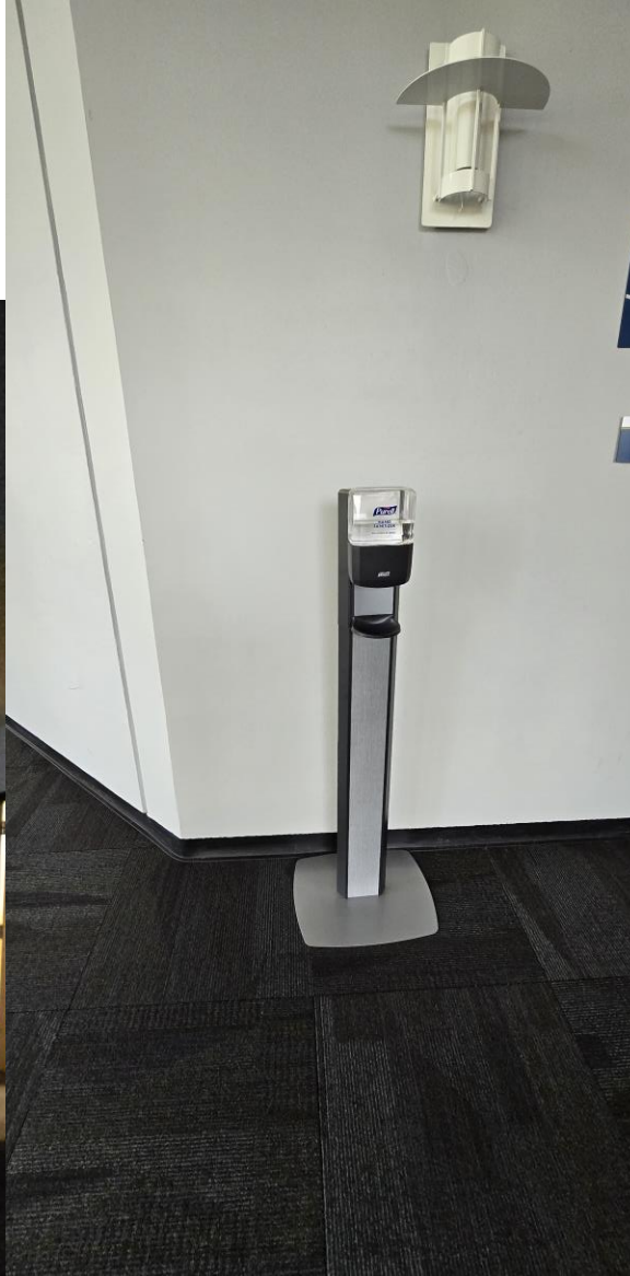
Automatic Hand Sanitizing Stations.