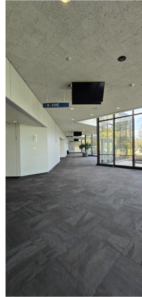
Elevators for Access to 200 level